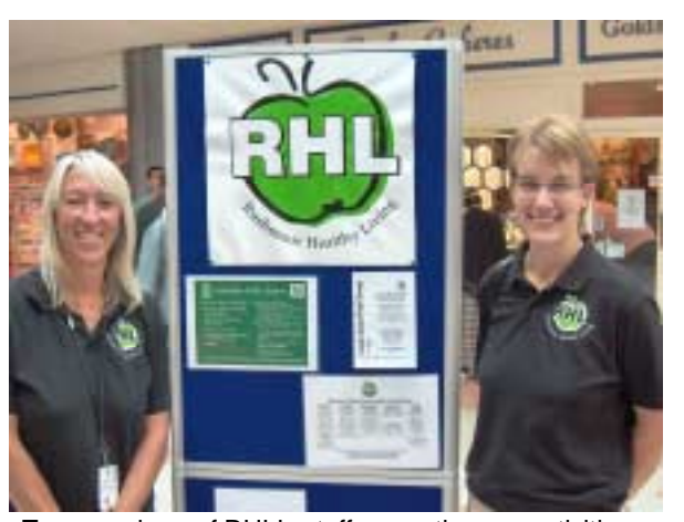
Two members of RHL's staff promoting our activities in Princes Mead Farnborough

Without volunteers many services would not be delivered and charities like ours would not be able to access those in need.