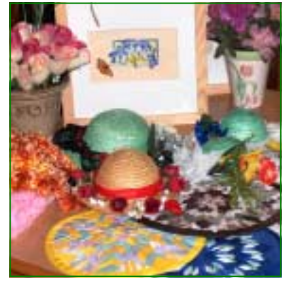
Produced by the residents Farren House

RHL provides equipment and materials for a weekly craft club. Due to the high quality of the items made we hope to encourage the residents to continue with the same enthusiasm and perhaps even develop a small social enterprise by selling seasonal crafts at local events.